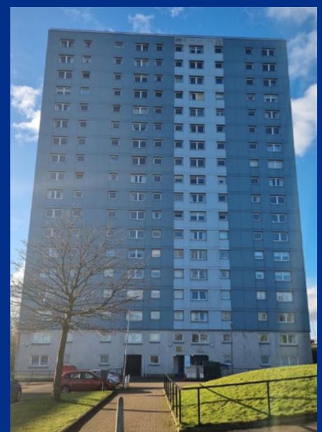
150 Berryknowes Avenue

Follow our Facebook page for details on dates and times of sessions: www.facebook.com/SouthsideHA